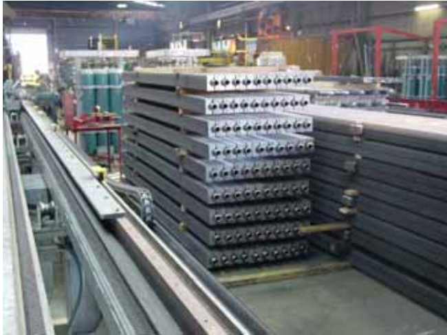
Finned tubing at Smithfield