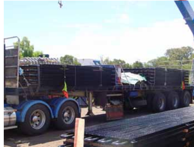
Packed for Dispatch