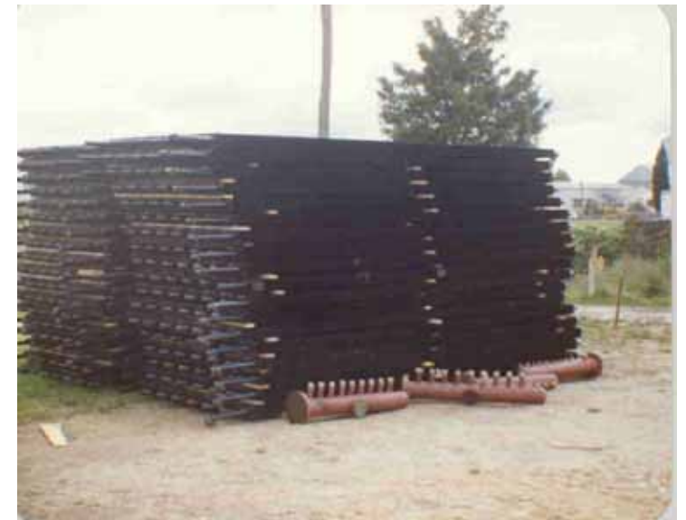
Elements and Headers Prior to Dispatch

Customer: TRANSFIELD POWER SYSTEMS Location: GLENBROOK STEEL MILL NEW ZEALAND Contract No: CM1650 Delivery Date: May 1996 Duty: 7.9 MW Heat Recovered